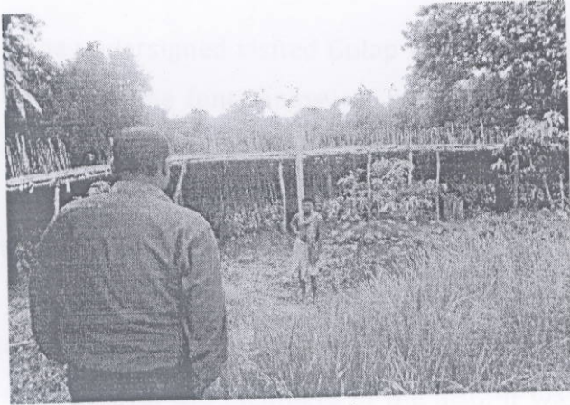
Maya SHG ( Paan Crop)